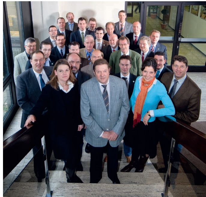
Team of management of HaGe